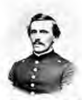
FIRST LIEUT, SOAR W. 15Y